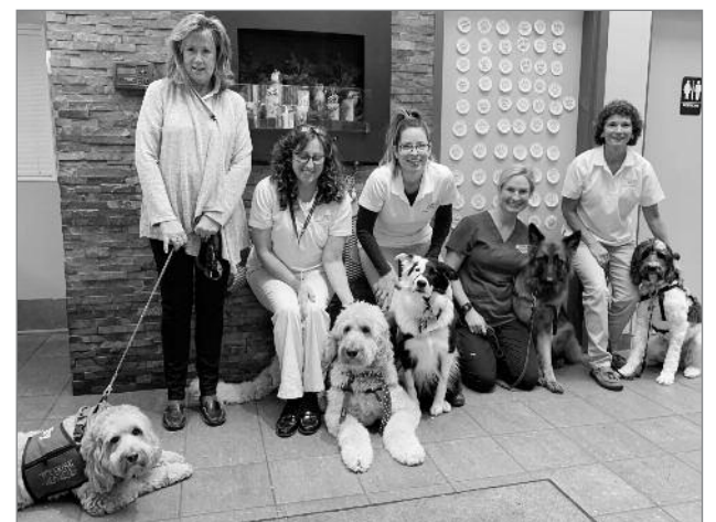
Members of the Caring Canines Pet Therapy Program pose in the lobby of Dogwood Acres Pet Retreat. Caring Canines has provided dogs for juveniles in court since the pilot program began in February 2018.

Jurors are given instructions on the purpose of the dogs, and children are able to reach down and pet them while they are