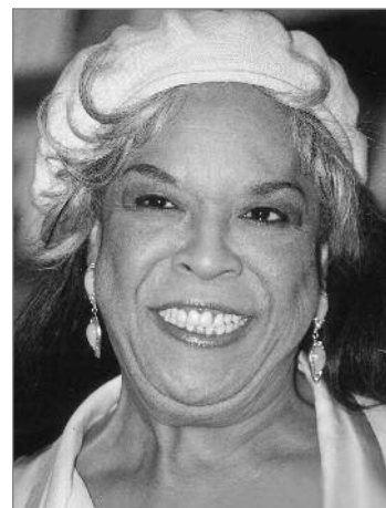
FROM WASH. D.C. MARCH 12, 1998 N.A.B.O.B.

Marietta is located at 5626 Bell Station Road, Glenn Dale, MD 20769 and is a property of the Maryland-National Capital Park and Planning Commission.