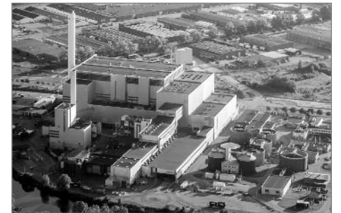
The SYSAV plant in Malmö is one of 33 waste-to-energy plants in Sweden.

More data coming in from other countries about the benefits they're deriving