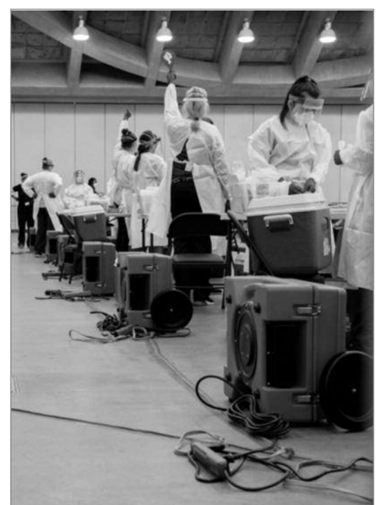
Each testing station at the site has a dedicated industrial-grade HEPA filter.

The Six Flags and Annapolis sites also are expanding operating hours for the winter. The Six Flags site is now open on Mondays from 2 to 6 p.m., Wednesdays from 8 a.m. to 12 noon, and Fri-