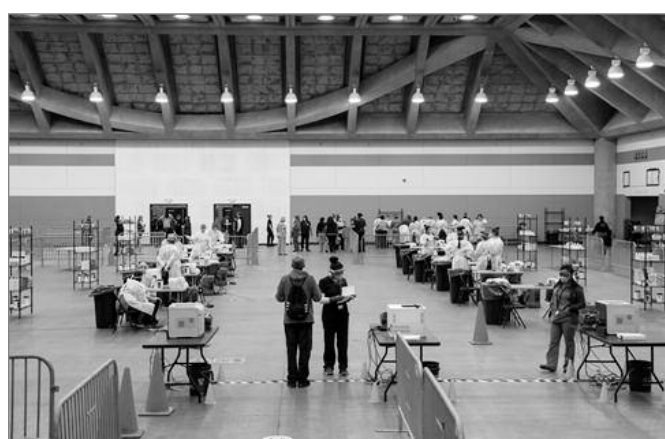
With more than 32,000 square feet of floor space and 32-foot-high ceilings, there is ample room for physical distancing and air circulation at the Baltimore Convention Center's new indoor testing space.