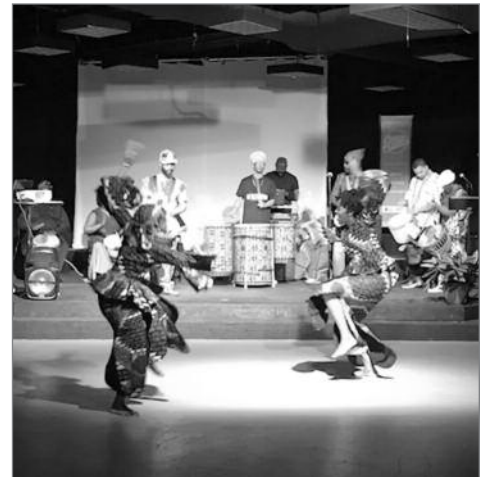
West African Dance and Drum Ensemble

gaging families in the 7 principles of Kwanzaa. This is our way of bringing the community together even though we are apart. Learn more about the celebration at: https://youtu.be/NppJcS-NCvU