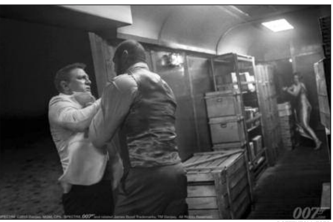
A cryptic message from Bond's past sends him on a trail to uncover a sinister organisation. While M battles political forces to keep the secret service alive, Bond peels back the layers of deceit to reveal the terrible truth behind Spectre.

"The dead are alive" appears as an epigraph at the beginning, hinting that the film will deal with one or two things: the resurrection of deceased persons, or a general fixation on death. Bond is reminded often of Vesper Lynd (Eva Green), who died in "Casino Royale," and of his beloved M (Judi Dench), who bit the dust in "Skyfall" but has a message for him in "Spectre." Bond's parents died, too, as you'll recall, and "Spectre" continues the trend of mining Bond's past for new complications—even when, as in this case, the new information is of