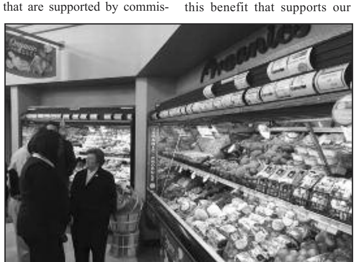
On Monday, February 1, 2016, U.S. Senator Barbara A. Mikul-

"Senator Mikulski's dedication and effort to help preserve