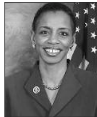
Congresswoman Donna F. Edwards