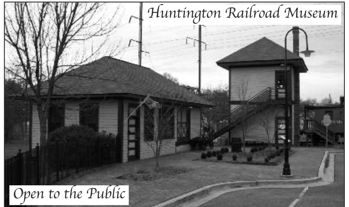
Huntington Railroad Museum

In the next steps of the process, Dr. Hayden's nomination goes to the Rules Committee for consideration and then to the full Senate for a vote.