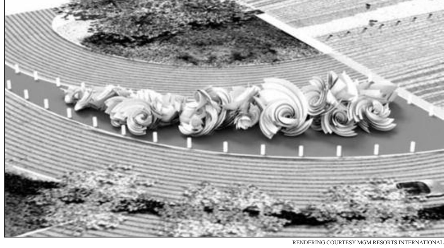
Alice Aycock—Whirlpools, 2016—located at the entry drive of the MGM National Harbor casino porte cochere.