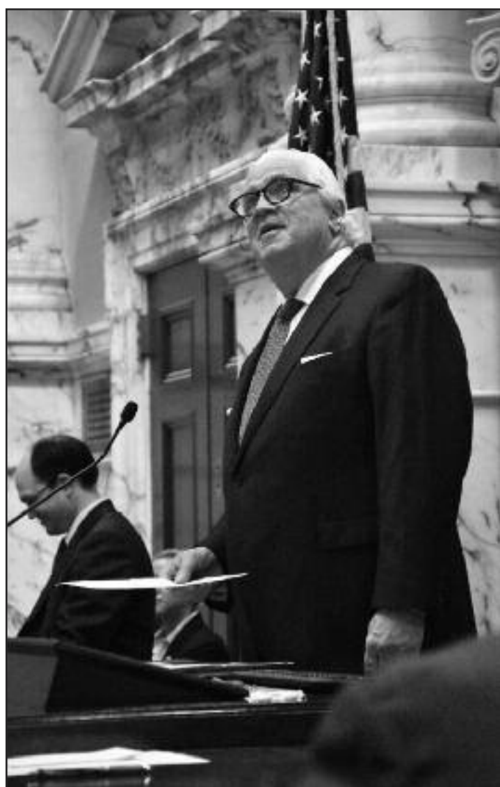
Sen. President Thomas V. "Mike" Miller Jr. looks over the chamber on Monday, April 11, the last day of the 2016 Maryland General Assembly.