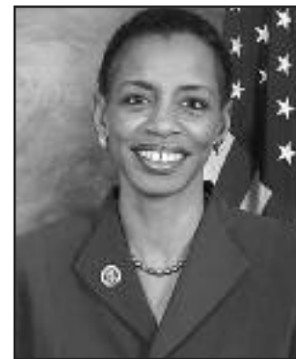
Congresswoman Donna F. Edwards

Several National Harbor attractions, retailers and dining outlets also offer up to 20 percent discounts to the mili-