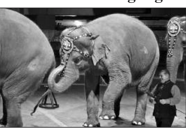
Ringling Bros. and Barnum & Bailey has transitioned its remaining circus elephants to a Florida-based facility focused on conservation, care and research.

Some of the documented abuses include Ringling Bros. elephants getting whipped and beaten by trainers and "yanked by heavy, sharp steel-tipped bull hooks behind the scenes, prior to performing." A PETA investigator who travelled with Ringling Bros. for several months documented many of the circus' elephants swaying and rocking continuously—"neurotic abnormal behavior typically seen in animals who are suffering from extreme stress, frustration, and boredom." Meanwhile, baby elephants were "torn away from their mothers and subjected to violent training sessions [to] learn how to perform tricks." PETA adds that at least 30 elephants, including four babies, have died prematurely from accidents or disease while travelling with Ringling Bros. since 1992.