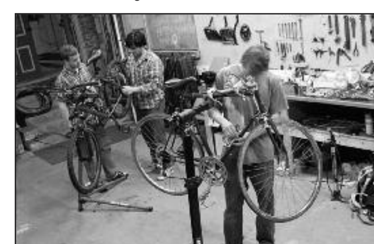
Middlebury College students who complete a free class on bicycle repair are rewarded with a free discarded bike.

Other forms of renewable energy have also seen tremendous success on college campuses. A University of New Hampshire project provides over 80 percent of its energy using landfill gas. And Ball State University in Muncie, Indiana has replaced its outdated coal boilers with 3,750