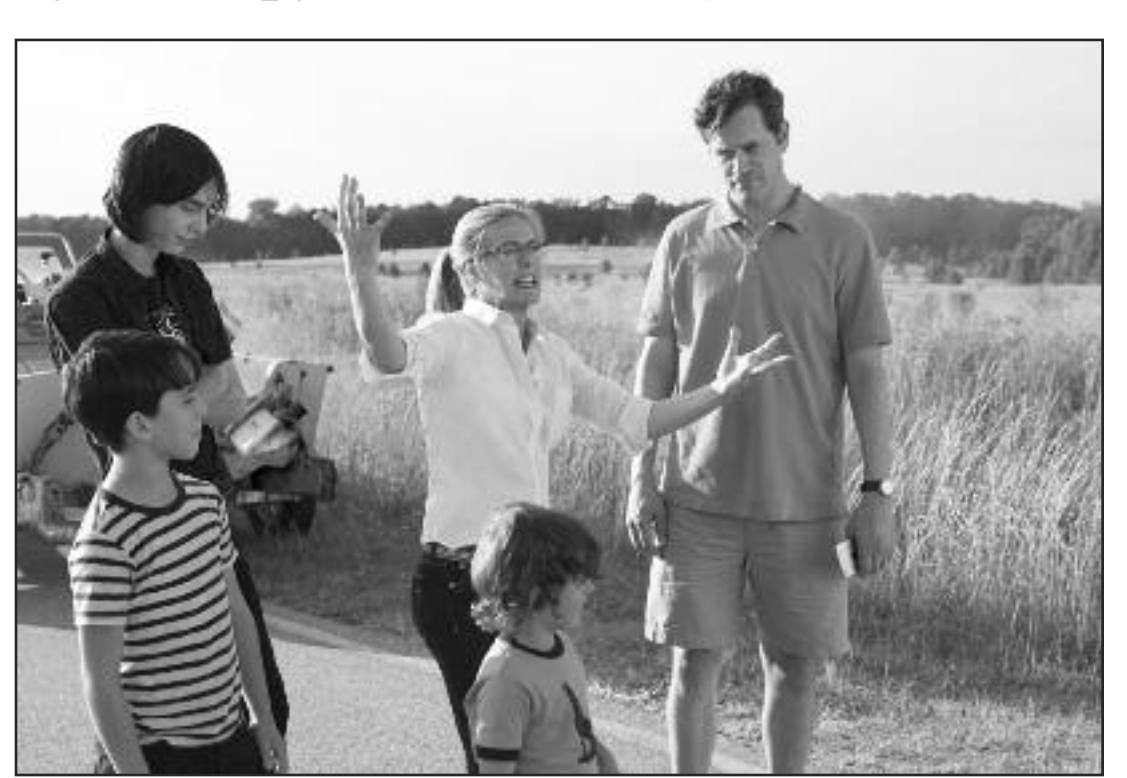
In Diary of a Wimpy Kid: The Long Haul, based on the record-breaking book series, a family road trip to attend Meemaw's 90th birthday party goes hilariously off course—thanks to Greg's newest scheme to (finally!) become famous.

The story, such as it is, consists of one improbably contrived mini-crisis after another, usually predicated on something false, as if conceived by 11-year-olds with no adults on hand to explain why that wouldn't work. For example, a defiance of the laws of physics,