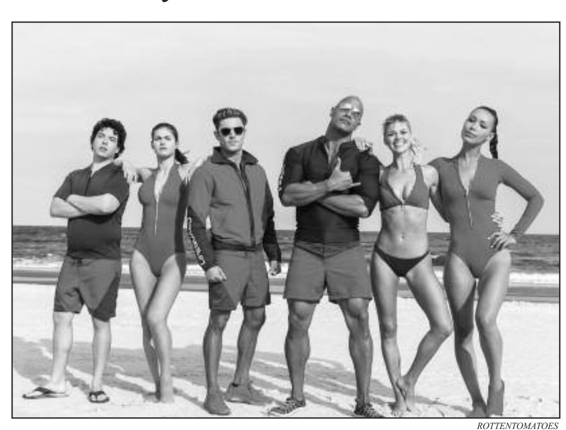
Baywatch follows devoted lifeguard Mitch Buchannon (Johnson) as he butts heads with a brash new recruit (Efron). Together, they uncover a local criminal plot that threatens the future of the Bay.

The plot concerns a villainous businesswoman named Victoria Leeds (Priyanka Chopra) who's flooding the beach with drugs and blackmailing city councilors as part of her plan to seize valuable beachfront property. What's curious about Victoria Leeds is that her scenes rarely even try to