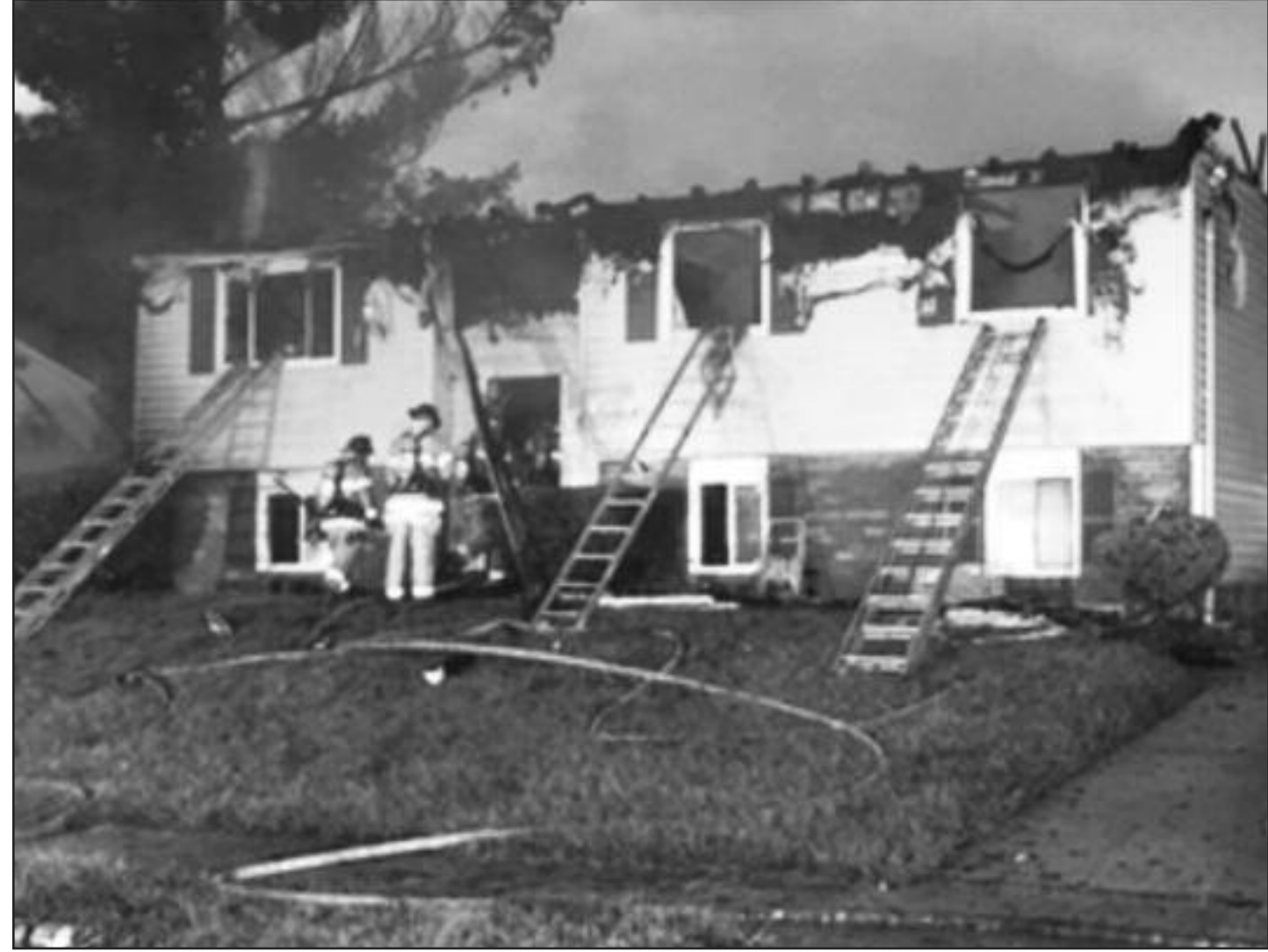
Conditions at Willow Hill Drive after fire was extinguished.

ten is described as a brown tabby domestic short-haired kitten with distinctive dark stripes and dots. The kitten appeared to have bite wounds and was transported to a local veterinarian for treatment. The Maryland Department of Health and Mental Hygiene (DHMH) confirmed that the kitten tested