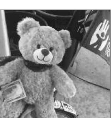
Miles, a teddy bear the cyclist's mom gave him, holds $100 on April 28, donated by what the 24-year-old calls a "road angel."

"I'm hoping that what Spencer is doing is going to in-