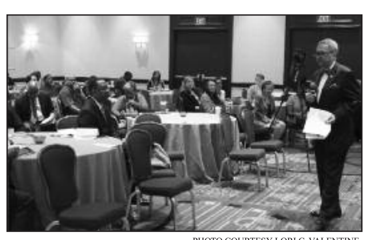
Prince George's County Welcomes 34th Annual National Organization for Black County Officials Economic Development Conference.