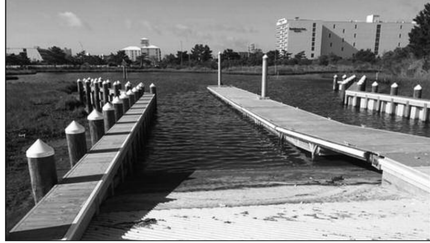
Bayside boat ramp in Ocen City Maryland