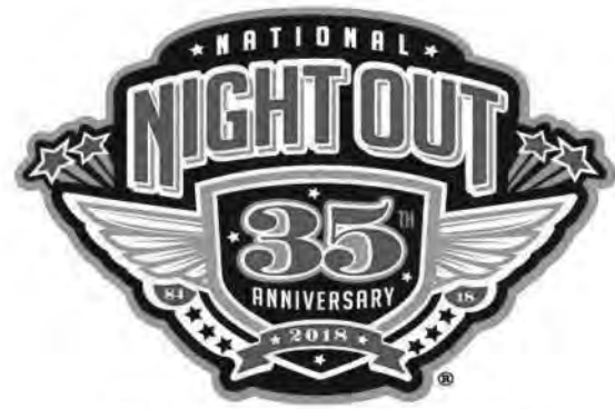
POLICE - COMMUNITY PARTNERSHIPS