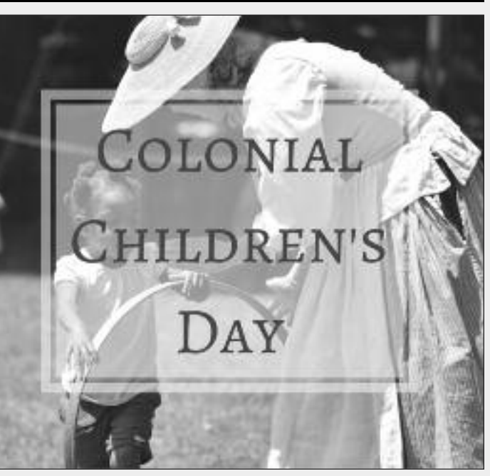
September 8, 2018 10 a.m.-2 p.m.

Spend the day in the life of the Boltons! Residents of the National Colonial Farm need your help tending to their 1770 tobacco farm. Discover the sights, sounds, and tastes of the 18th century. Make and take home a crafty keepsake to remember a day in the life of a colonist. Rain date: September 15, 2018.