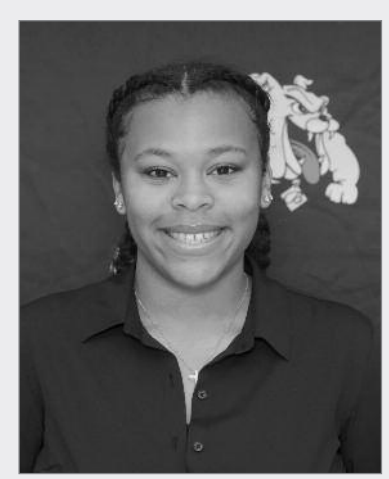
PHOTOGRAPH COURTESY BOWIE STATE SPORTS INFORMATION

—Gregory C. Goings, Bowie State Sports Information