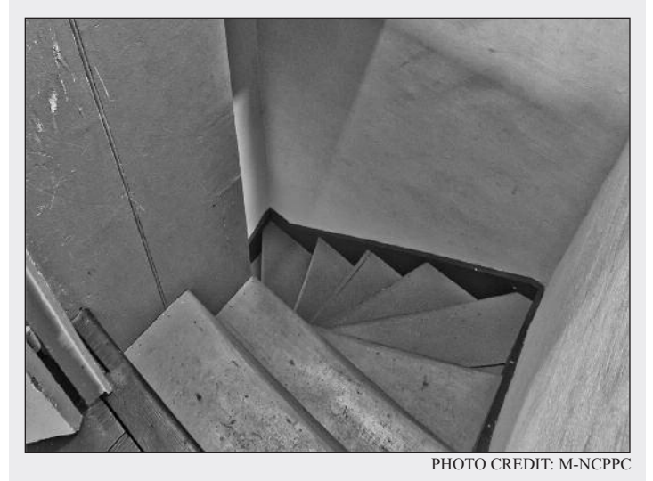
Looking down Secret Staircase at Montpelier

(Muirkirk Road at Rte 197), Laurel, Maryland 20708 Contact: 301-377-7817, TTY: 301-699-2544