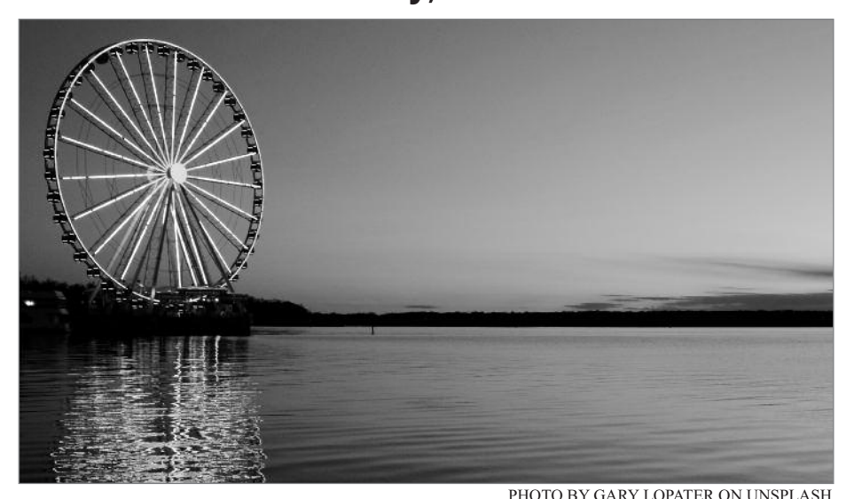
Sunset on the Harbor

NATIONAL HARBOR, Md., (November 22, 2019)-On Small Business Saturday, the Waterfront District at National Harbor celebrates its boutiques and small businesses. The area has more than 70 retailers and restaurants, in addition to the Capital Wheel, carousel and ongoing activities and programs on the waterfront. Easy parking and walkable streets make it an ideal destination this holiday season. In honor of Small Business Saturday, the Waterfront District is offering free parking from noon until 6 p.m. on Saturday, November 30. Guests will receive their free parking voucher when they purchase anything from any restaurant or store in the Waterfront District.