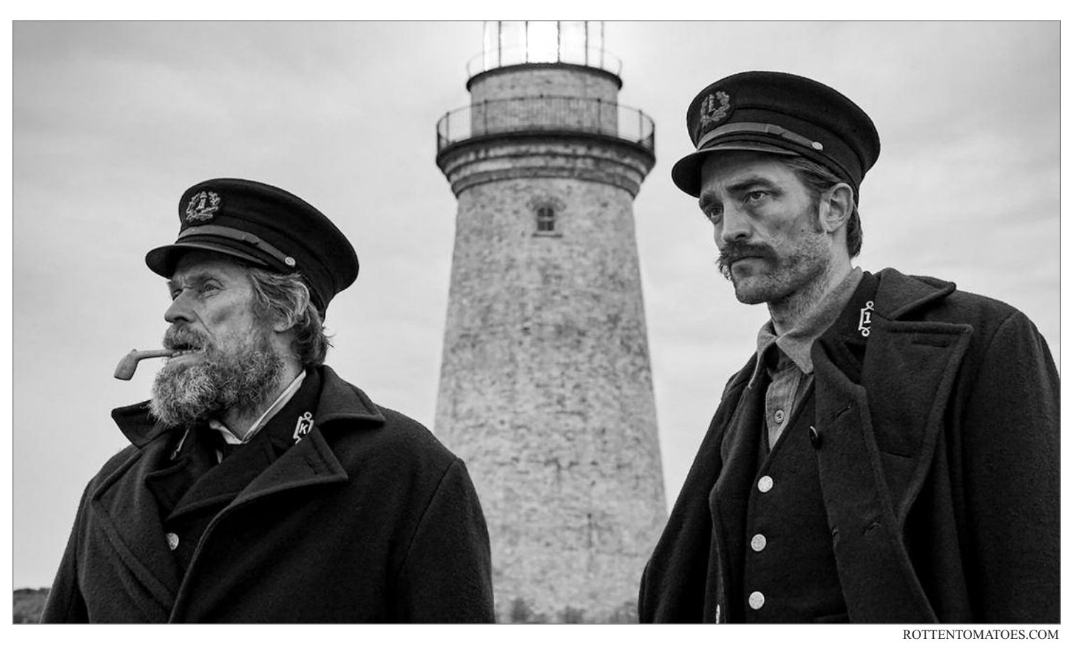
From Robert Eggers, the visionary filmmaker behind modern horror masterpiece The Witch, comes this hypnotic and hallucinatory tale of two lighthouse keepers on a remote and mysterious New England island in the 1890s.

ing, talking, and yelling. Confessions are made-or in Thomas' parlance, beans are spilled-backstories are revealed, and our two "wickies" become a bickering, drunken old married couple. "The Lighthouse" is as creeping and methodical as "The Witch" was, and its climax prompts similar thoughts of "this is bonkers," but the oddness is more bemusing than terrifying-enjoyably weird rather than soul-shakingly bizarre.