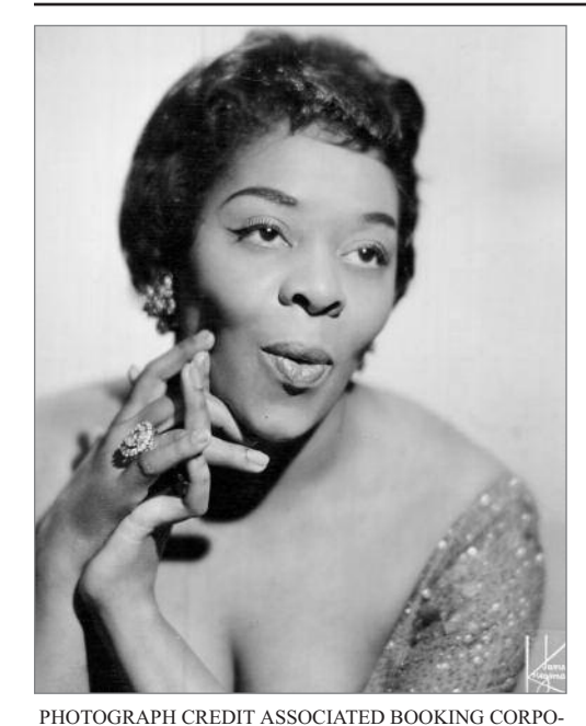
RATION/PHOTO BY JAMES KRIEGSMANN, NEW YORK,

MARIETTA HOUSE MUSEUM AND PRINCE GEORGE'S COUNTY HISTORICAL SOCIETY PRESENTS: