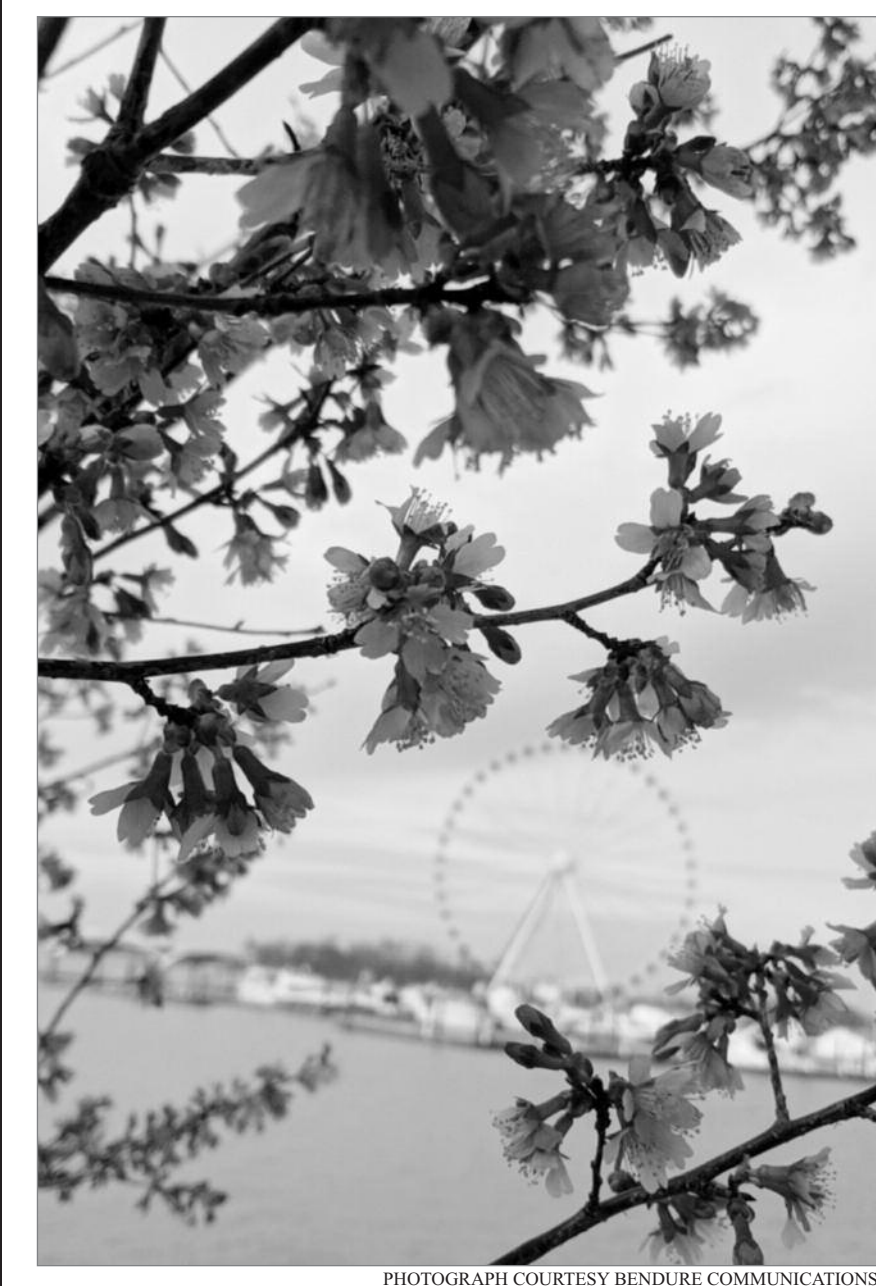
National Harbor's cherry trees were blooming last week! It's a great sign that spring is just around the corner.