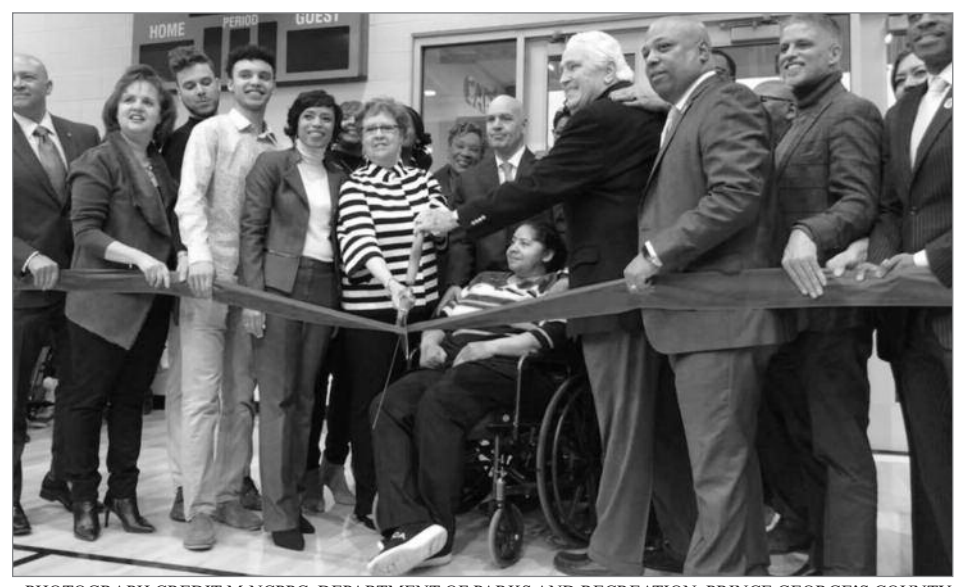
Ribbon-cutting ceremony held Feb. 29, 2020 to open The Southern Area Aquatics and Recreation Complex (SAARC) in Brandywine.

Thousands of residents came out to see the building's features and amenities including a double gymnasium, flexible programmable spaces, a fitness center and running track. The natatorium that welcomed eager swimmers even on the cold winter day consists of three separate bodies of water: a 25-yard Lap Pool with six lanes, a leisure pool, and a spa. The new facility also includes three pieces of public art inspired by the 150-year-old Willow Oak tree located adjacent to the building. With more than 30 Proctor family members in attendance, including Delegate Susie Proctor, the plaque dedicating The James E. Proctor, Jr. Center at The Southern Area Aquatics and Recreation Complex was unveiled to honor his unwavering advocacy and extensive efforts to secure the funding that brought SAARC to fruition.