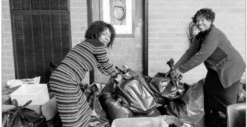
Members of Alpha Kappa Alpha Sorority Inc., Psi Epsilon Omega Chapter

sort shoes headed for developing countries to help families in need.