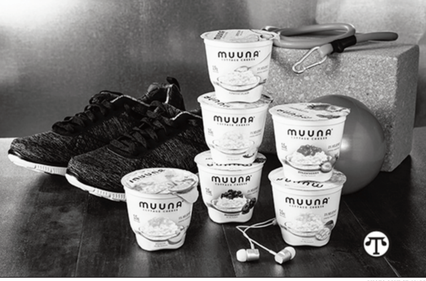
For protein on the go, choose cottage cheese with real pieces of fruit.

• Cottage Cheese —What was once considered a boring diet food has been reimagined as a protein-packed snack item, available in a variety of flavors and conveniently portable single-serving cups. One such brand, Muuna<sup>®</sup>, recently