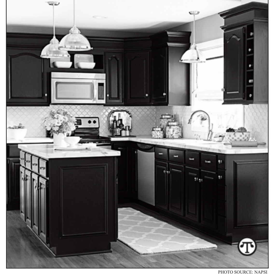
You can save time and trouble when your home is neat as well as clean. A few simple steps and inexpensive items can help.

Ultimately, it's important to remember to not bite off more than you can chew. One of the biggest mistakes people make when decluttering is not setting