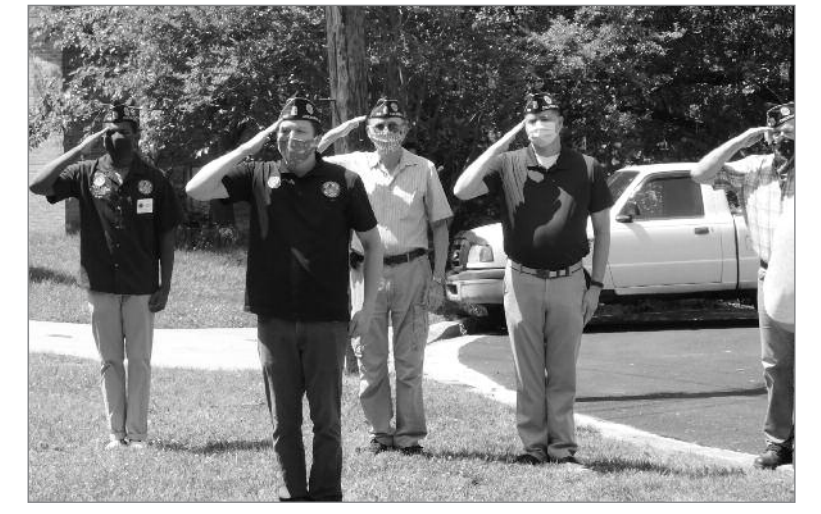
AT LEFT: Proclamation from Governor ABOVE: American Legion Post Salute AT RIGHT: Branchville Volunteer Fire Company