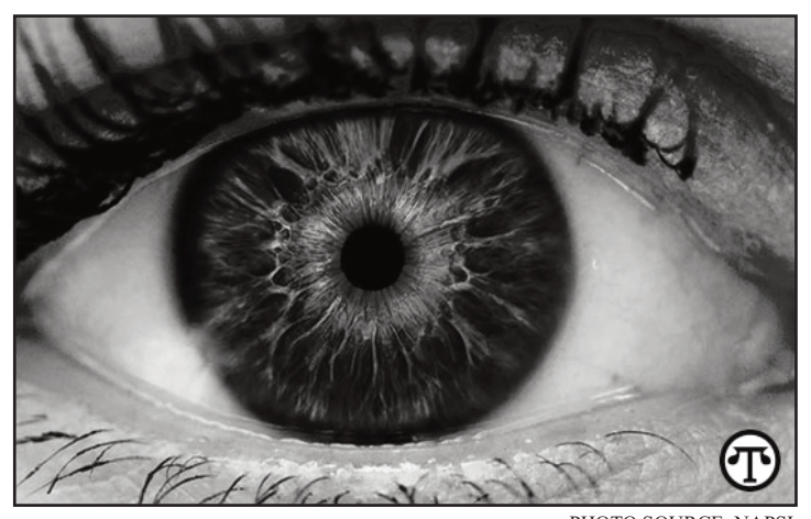
It's a wise idea for women over 40 to get regular eye care.

For more information, visit www.nei.nih.gov/hvm.