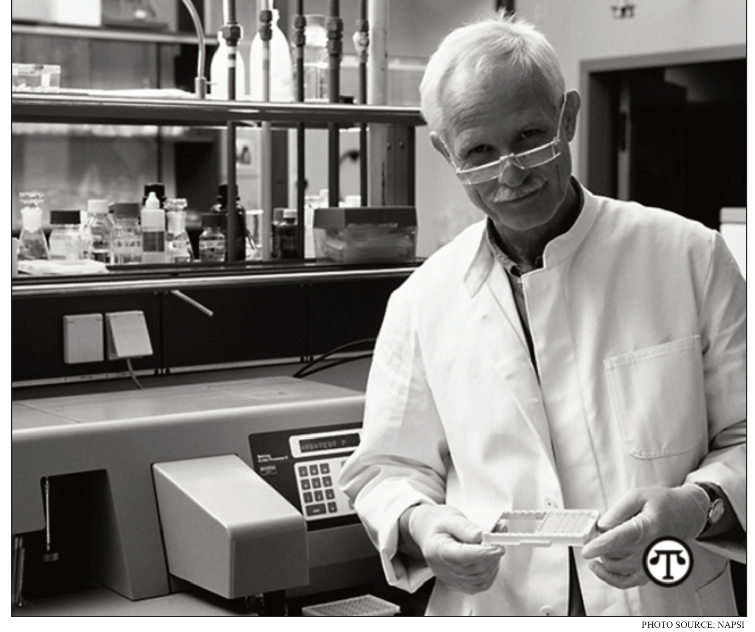
Endocrinologists and other scientists are working on ways to help people with diabetes avoid the risks of low blood sugar.

lated, is associated with shortand long-term mortality risk."