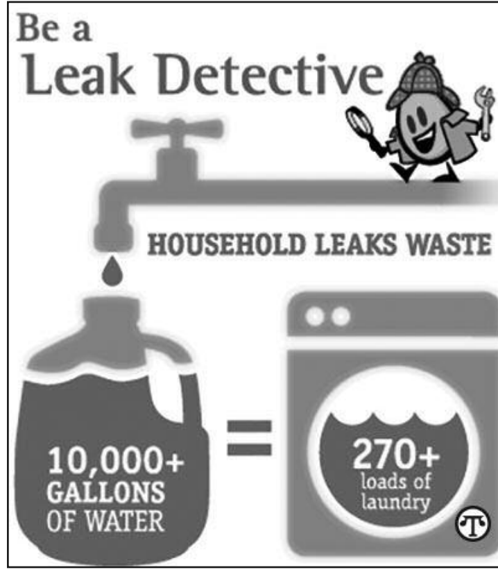
Leaky plumbing fixtures in your home can waste the amount of water it takes to wash 270 loads of laundry.

Twist: Next, snoop around for dripping pipes or fixtures. Just one showerhead that drips 10 times per minute can waste more than 500 gallons of water