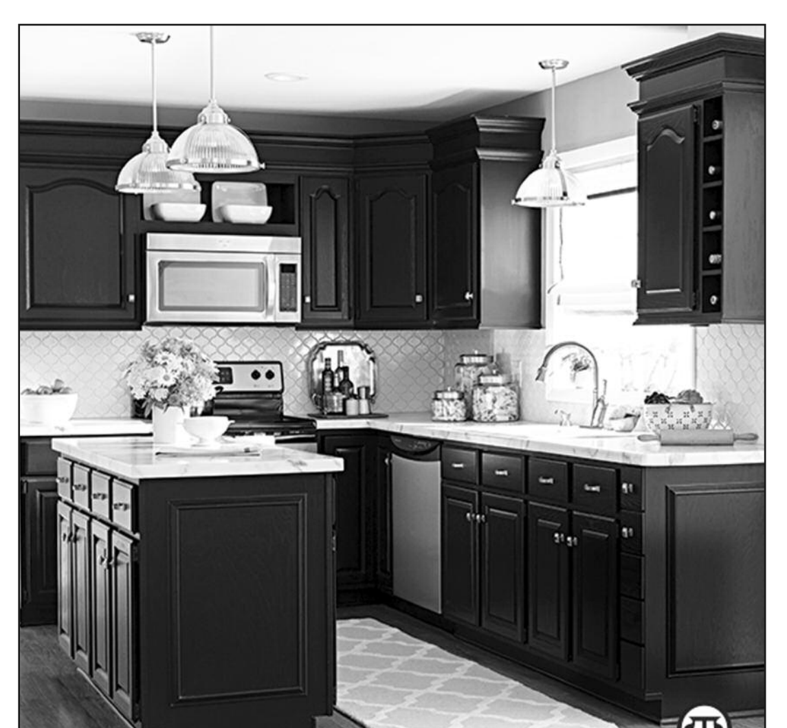
You can save time and trouble when your home is neat as well as clean. A few simple steps and inexpensive items can help.

Ultimately, it's important to remember to not bite off more than you can chew. One of the biggest mistakes people make when decluttering is not setting