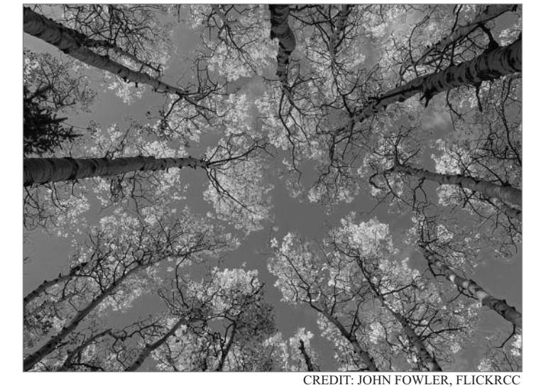
Quaking aspens are just one type of iconic American tree species that's losing ground against global warming.

Researchers from the North Carolina-based