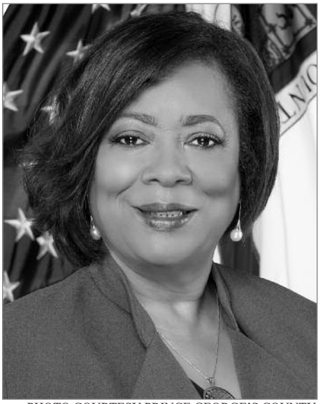
Prince George's County Chief Informa-