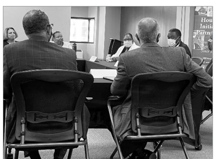
AND COMMUNITY DEVELOPMENT

"Success is achieved when landlords and tenants work together to complete applications for funding," said Aspasia Xypolia, Director of DHCD. "The program covers rent and utility delinquencies only for occupied units and presents a win-win proposition for tenants and landlords. We are able to cover accumulated debt payments to landlords and keep residents safely housed when everyone works together. The partnerships and exemplary efforts of our community partners who work closely with tenants as they navigate the application process is crucial to the success of this program."