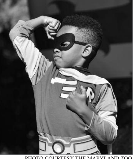
Young guests are encouraged to wear costumes to ZooBOOO!

Founded in 1876, The Maryland Zoo in Bal-