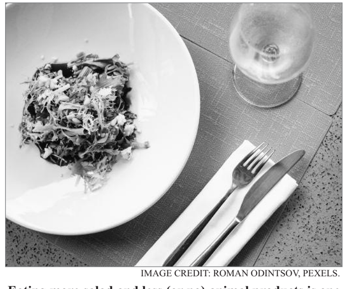
Eating more salad and less (or no) animal products is one of the most impactful ways you can fight climate change and help the planet.

Worse, 58 percent of food emissions come from animal products alone. Another