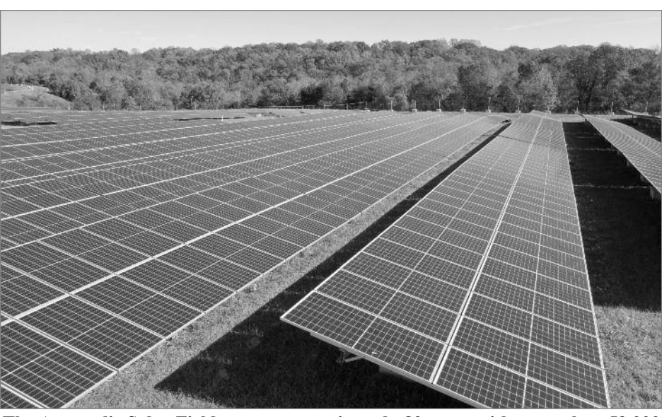
The Annapolis Solar Field covers approximately 80 acres with more than 52,000 solar panels that generate approximately 24,000,0A00 kilowatt hours of clean electricity each year, the equivalent of removing more than 15,000 metric tons of carbon dioxide from the environment. according to EDF Renewables, which built it.

ate jobs, saying the solar and wind energy sector should produce thousands of oppor-