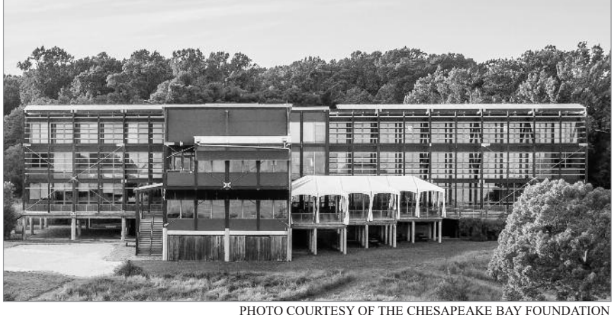
The Chesapeake Bay Foundation touts the Philip Merrill Environmental Center as a success story in green infrastructure. Officials said the building uses 57% less energy than a standard office building, saving up to $80,000

Hindle, who has worked on new construction and retrofitting projects across the country, emphasized the social cost of not taking action to tackle greenhouse gas emissions.