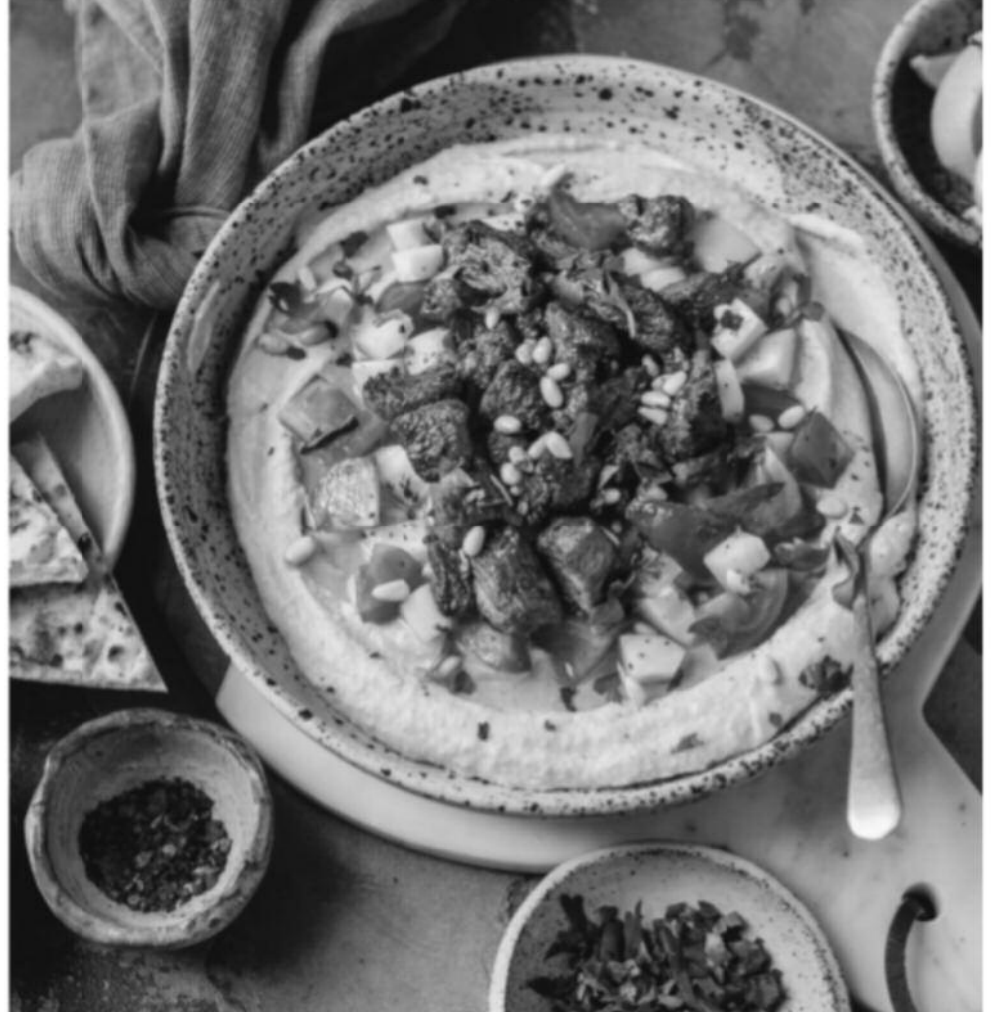
Spiced Grass-Fed Lamb Over Hu

Top with squeeze of lemon juice and serve with flatbread or tortilla chips.