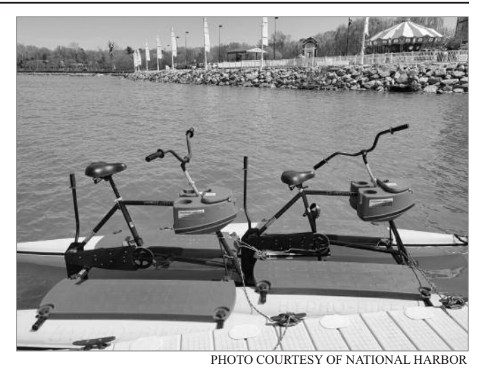
Last year, National Harbor added hydrobike water bikes.

Movies on the Potomac features top movies shown on the outdoor, waterfront screen (150 National Plaza) from May through September with family movies on Sundays at 6 p.m. and "date night" movies on Thursdays at 7 p.m. Attendees are encouraged to bring carryout from any of the many restaurants in the Water-