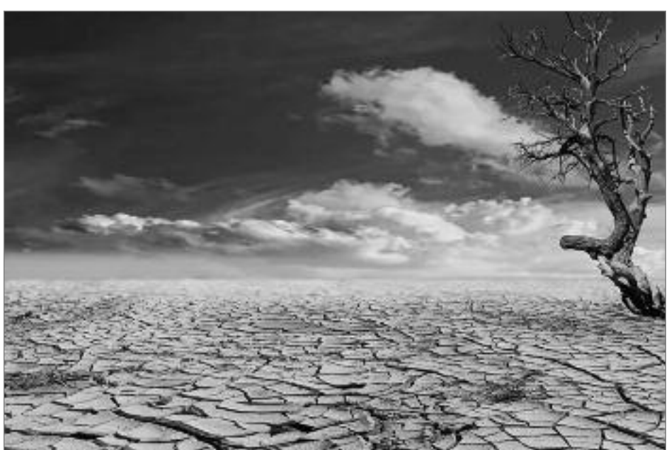
While climate change might benefit the economy overall, we would rather not have to deal with it at all.

There are also those who clean up and restore locations destroyed by natural disasters like hurricanes, which according to the Environmental Defense Fund have increased in frequency by three times since 1900 because of the climate crisis.