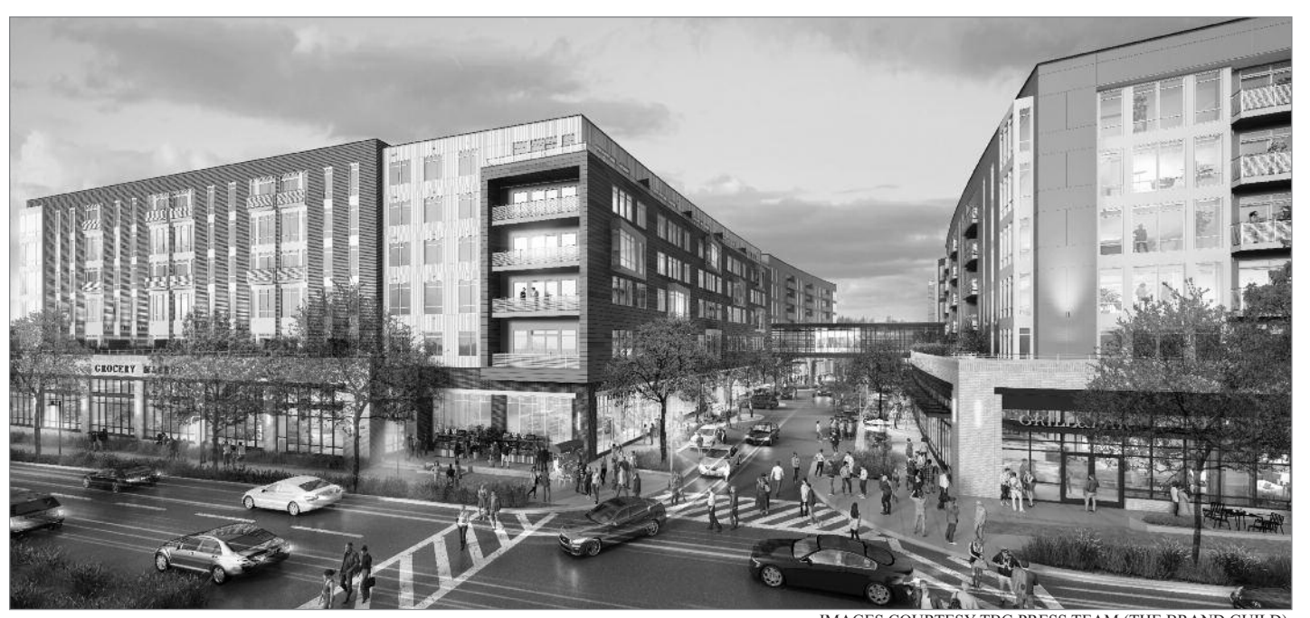
Exterior of the Aster, College Park

The Prince George's County Planning Department of The Maryland-National Capital Park and Planning Commission (M-NCPPC) is responsible for preserving, protecting, and managing the county's resources through high-quality planning services and growth management guidance. Visit our website, www.pgplanning.org to learn how you can become engaged in shaping the future of your community.