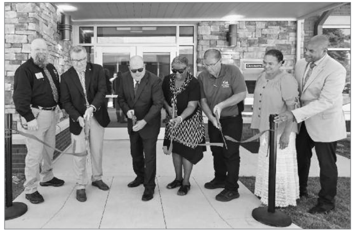
Ribbon cutting ceremony at Cheltenham Veterans Cemetery administration building.

The new administration building provides space for the honor