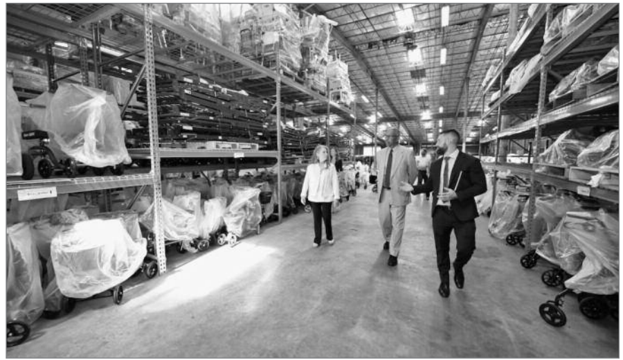
Lt. Governor Rutherford tours the DME headquarters.

Many Marylanders require the use of DME-such as wheelchairs, home hospital beds, shower chairs, walkers, and other assistive devices-to maintain their independence, safety, and standard of living. The cost of this equipment can be a financial burden, not only to uninsured residents but also to residents whose insurance will not approve the equipment needed or for whom approval is delayed. This innovative program offers DME to Marylanders across the state regardless