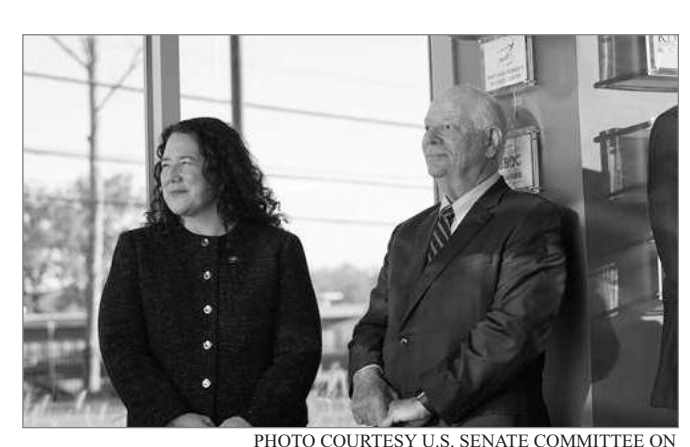
SMALL BUSINESS & ENTREPRENEURSHIP

The WBC program is a national network of more than 140 centers across all 50 states that offer counseling, training, networking, workshops, technical assistance, and mentoring to entrepreneurs. These centers support entrepreneurs at all stages of the business development process, including assistance with writing a business plan, conducting market research, navigating the federal procurement process, and other business management and operations skills. The WBC program played a key role in SBA support of small businesses during the pandemic and continues to serve thousands of clients. WBCs served more than 88,000 clients in 2021, a 36 percent increase from the 64,000 clients served in 2019.