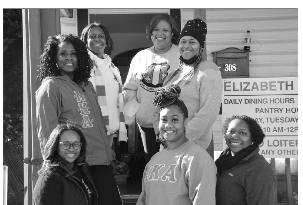
Members of Psi Epsilon Omega Chapter of Alpha Kappa Alpha Sorority, Incorporated® deliver and distribute fresh produce to Laurel, Md. families.

The sorority is hoping its 1908 Harvest Project will increase the crop yield and a