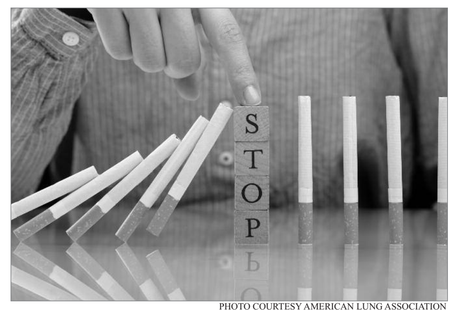
2023 is the year to quit tobacco.