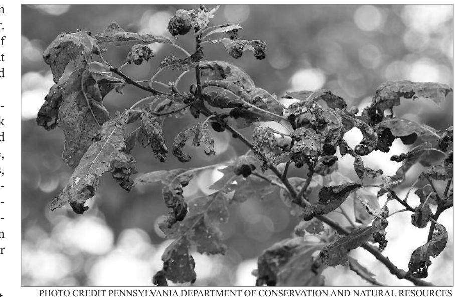
An oak tree in Pennsylvania suffers from oak anthracnose, a fungus that especially infects trees during cool, wet springs.