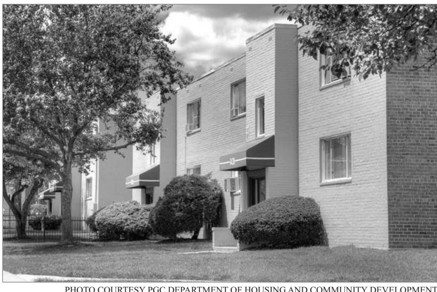
Exterior—Bedford and Victoria Station

"Prince George's County's investment in Bedford & Victoria Station via the ROFR Preservation Fund loan exemplifies the County's commitment to preserving quality, attainable housing longterm in partnership with our firm," said