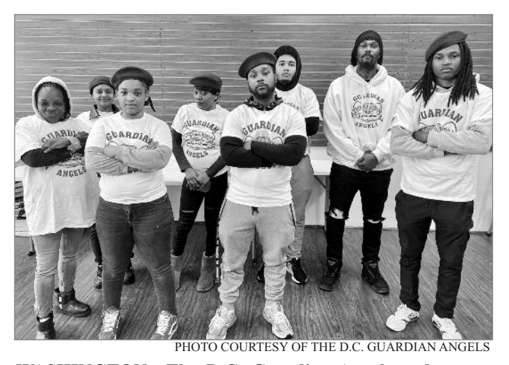
WASHINGTON—The D.C. Guardian Angels, volunteers dedicated to keeping public spaces in the city safe, have started patrolling the Metro's Green Line in an effort to serve as a crime deterrent.