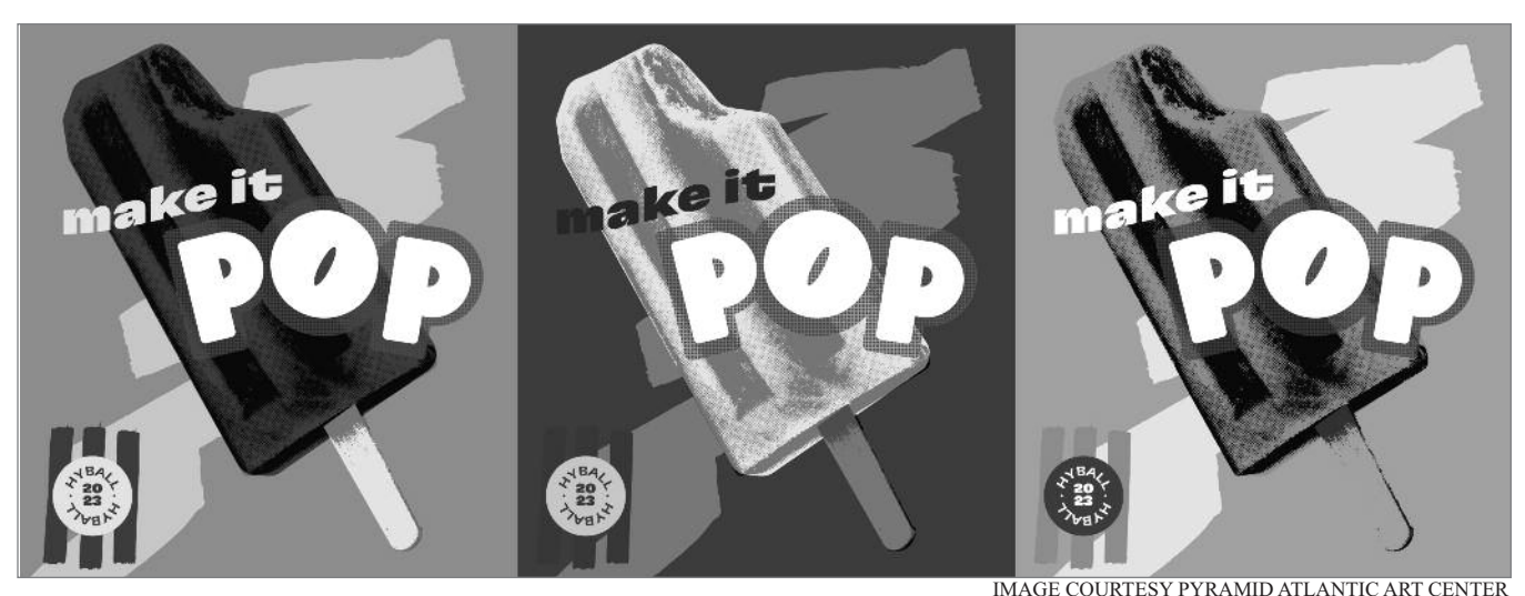
Pyramid Atlantic Makes It Pop!

Having commemorated its 40th year in 2022 after being founded in 1982, the nonprofit [501(c)(3)] Washington Regional Alcohol Program (WRAP) is a coalition of diverse interests using effective education, innovative programs and targeted advocacy to end alcohol-impaired driving and underage drinking in the Washington, DC metro area. Through public education, innovative health education programs and advocacy, WRAP is credited with keeping the metro-Washington area's alcohol-related traffic deaths historically lower than the national average.