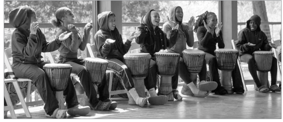
Gwynn Park High School Makerspaces for Dancers/Movement Exploration

—Wolf Trap Foundation for the Performing Arts