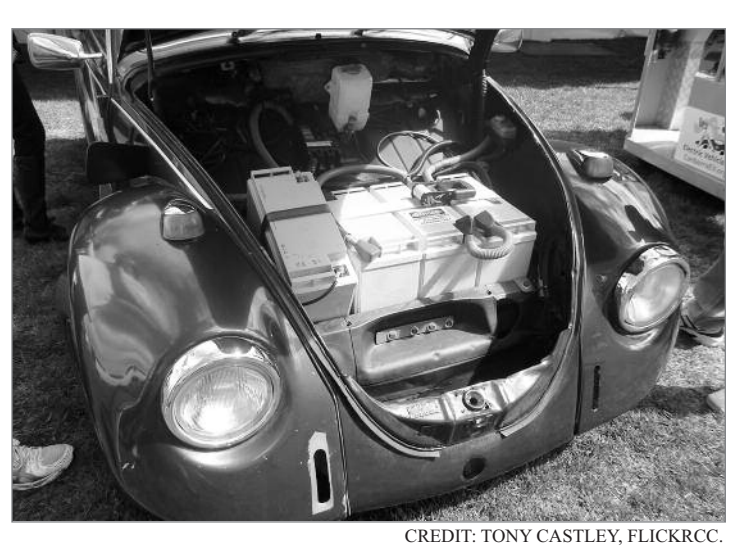
It is technically possible to convert a gas-powered car to an EV, but not without complications and expense.