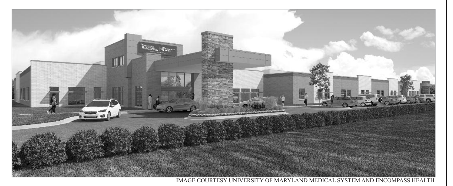
Rehabilitation Hospital of Bowie is located at 17351 Melford Boulevard.