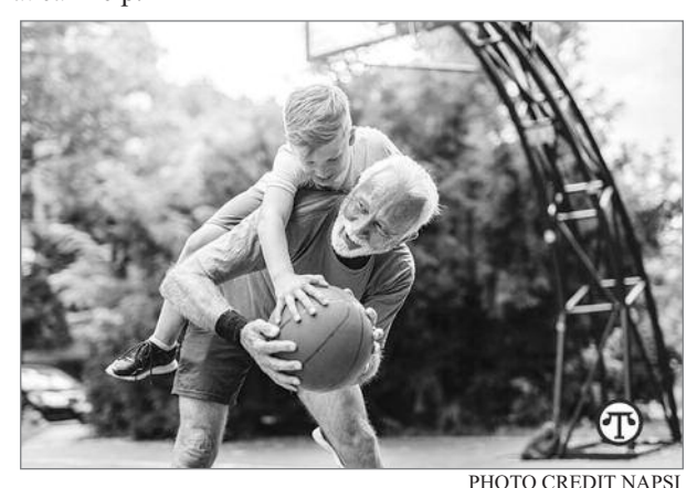
Fun with your grandkids is just one good reason to get physically fit.

"Functional fitness uses multiple muscle groups and movements to help train muscles, joints, limbs, and nerves to all work better together for everyday tasks,