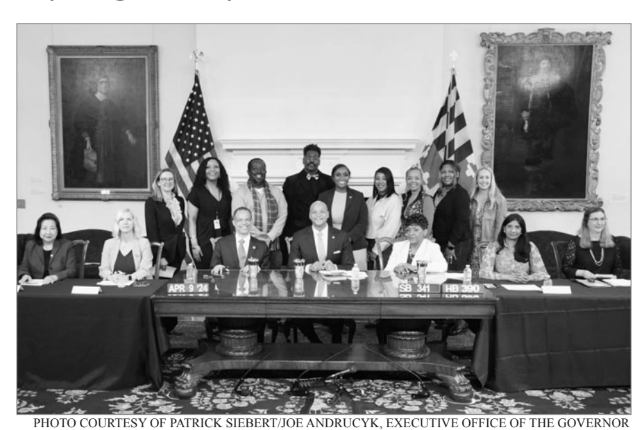
MCAAHC & BDM staff, MCAAHC commissioners, and partners with Gov. Wes Moore and supporting officials and legislators.

The decision reflects the museum's commitment to inclusivity and recognition of the contributions of Tubman to